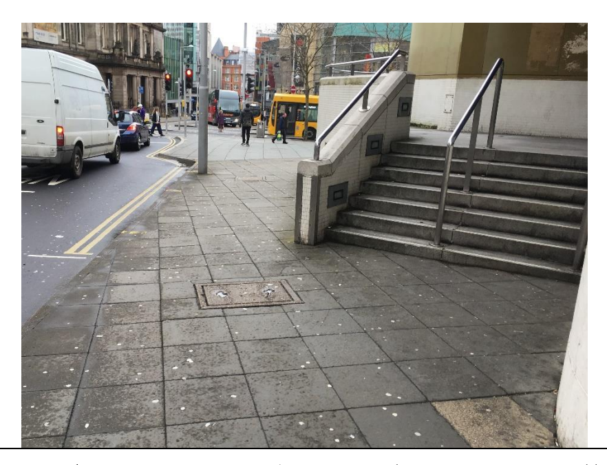
The ramped entrance to the Royal Concert Hall will be to your right.

To get to the entrance of The Royal Concert Hall, walk down Burton Street, towards South Sherwood Street.