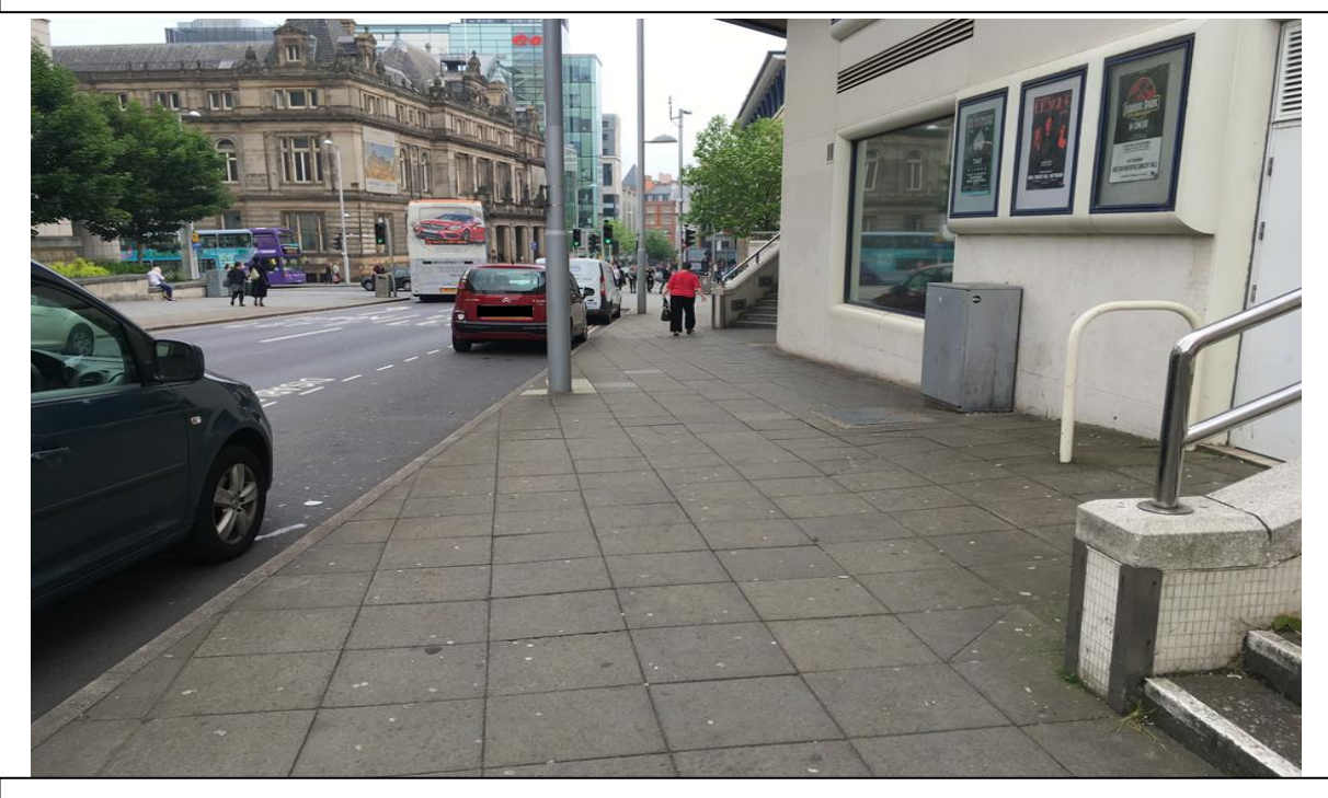
The blue badge parking spaces are next to the side of The Royal Concert Hall.

The Royal Concert Hall is 50 meters from Burton Street. The Theatre Royal is approximately 200 meters from Burton Street.