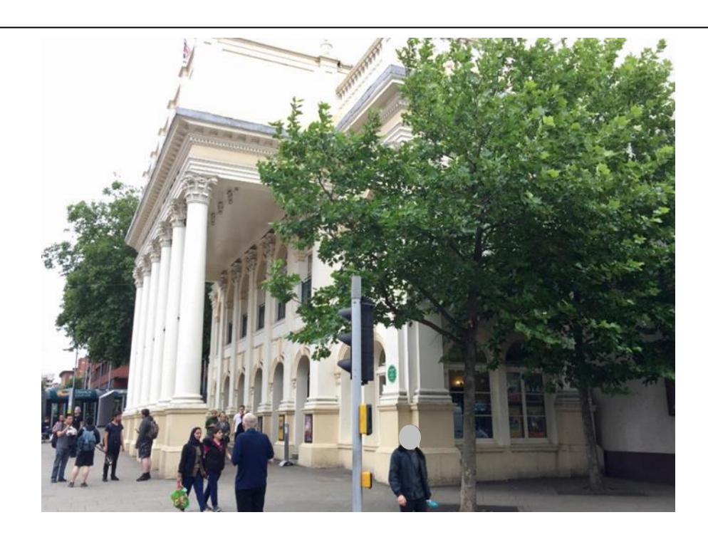
The entrance to the Theatre Royal is on Upper Parliament Street.