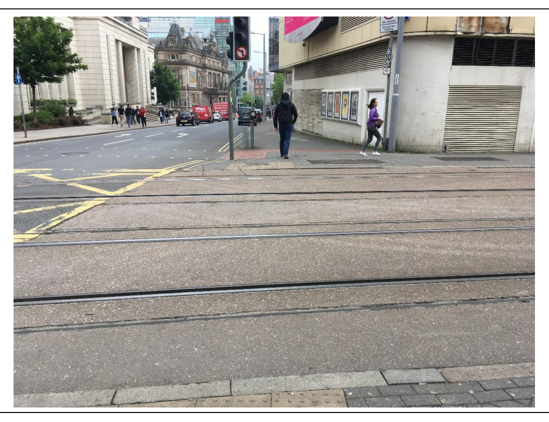
Continue to walk down Burton Street.

Cross Goldsmith Street towards the back of The Royal Concert Hall. You will now be on Burton Street.