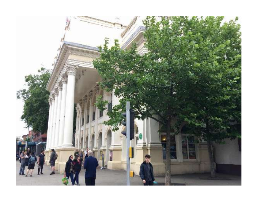
The entrance of the Theatre Royal

Turn right on Upper Parliament Street, you will see the entrance to the Theatre Royal.