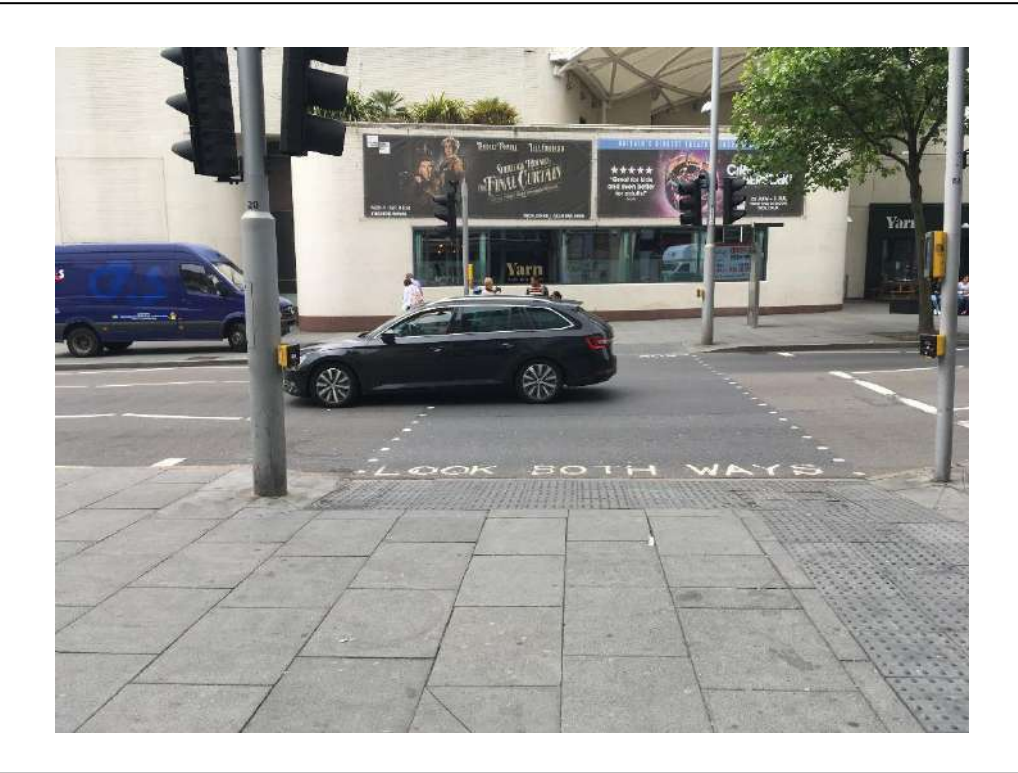
You will see the entrance to Yarn and the Royal Concert Hall.

Use the pedestrian crossing to cross South Sherwood Street.