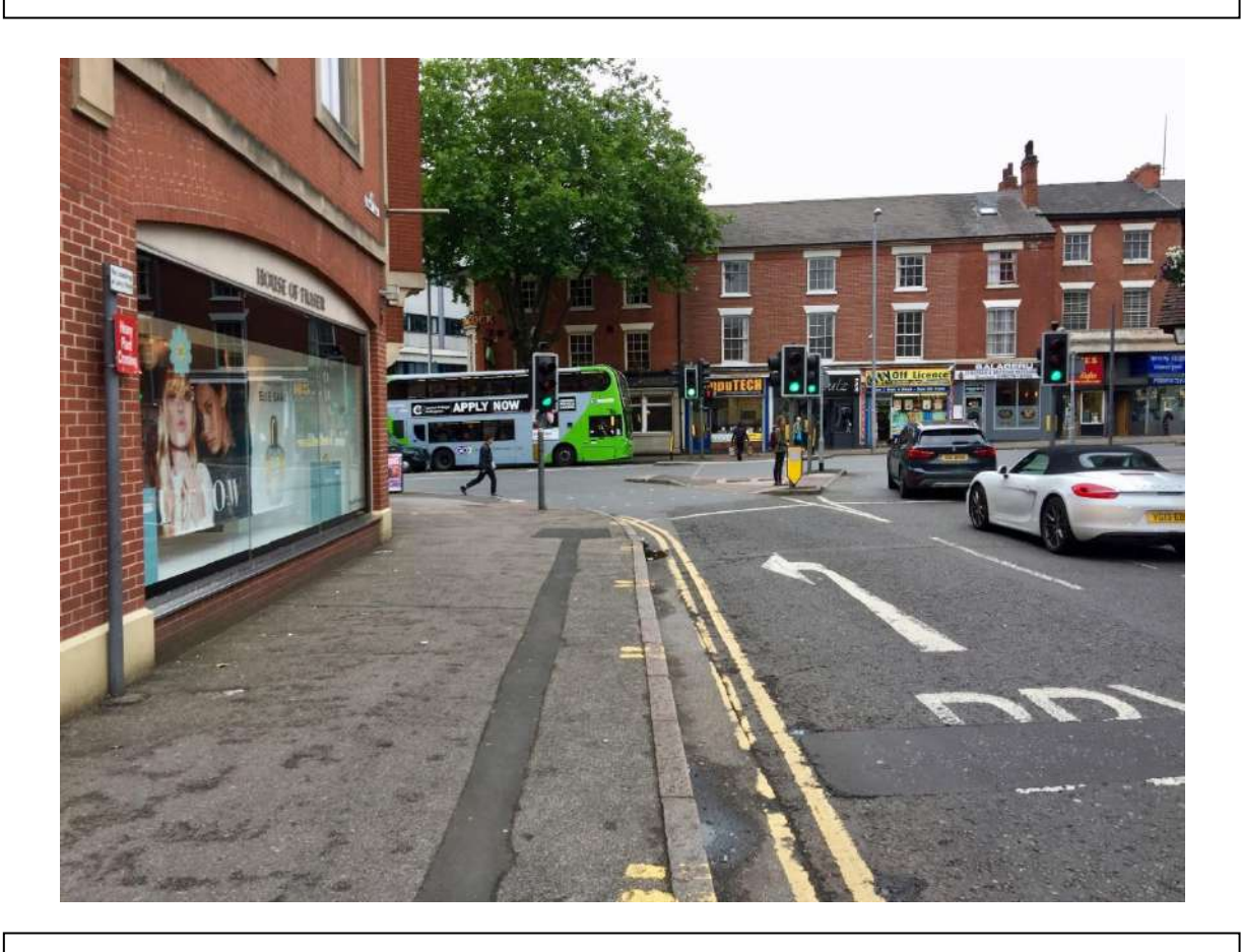
At the end of Union Street, turn left on to Mansfield Road.